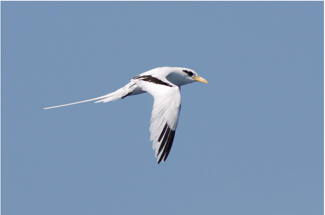
White-tailed Tropicbird

Coastal North Carolina harbors a marvelous array of breeding species in its hardwood swamps, pine forests, salt marshes, and barrier beaches. This tour will sample all these habitats and also spend two days exploring North Carolina's rich offshore waters. Beginning in the Wilmington area, we'll search for such southeastern specialties as Wilson's Plover, Red-cockaded Woodpecker, Brown-headed Nuthatch, Swainson's and Prothonotary warblers, Summer Tanager, Bachman's Sparrow, and Painted Bunting. An optional evening trip may afford a chance to see Chuck-will's-widow and