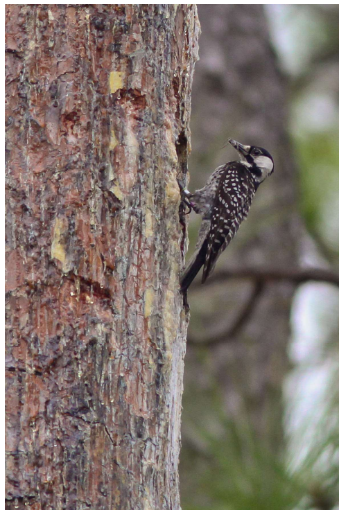
Red-cockaded Woodpecker

May 19, Day 3: Croatan National Forest and Environs. Croatan National Forest features coastal and inland swamp habitats. Significant natural features include pocosin habitat, estuaries, and a large number of carnivorous plants. Our first stop this morning will be to search for the local and declining Red-cockaded Woodpecker. This species nests exclusively in old growth southern pine forest, particularly favoring longleaf pine. Red-cockadeds are unique among North American woodpeckers in that they usually nest in extended family clusters (often incorrectly referred to as colonies), typically using live trees for nest cavities. The same cavities may be used for many years, and tiny resin wells dug around the cavities create a sticky resin shield, which protects the nest from rat snakes. While the woodpeckers will be our primary target for the morning, we will also run across other species of interest including Red-headed Woodpecker, Brown-headed Nuthatch, Pine and Prothonotary warblers, Bachman's Sparrow, and hopefully Swainson's Warbler.