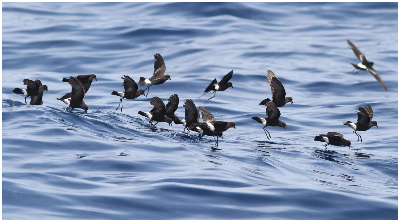
Wilson's Storm-Petrels

May 23, Day 7: Pea Island NWR to Norfolk. After breakfast this morning we will drive north along the Outer Banks, stopping to investigate the large impoundments at Pea Island National Wildlife Refuge, on the north end of Hatteras Island. Even in early June, there should be a few lingering migrant shorebirds around, as well as local breeders such as American Oystercatcher and Black-necked Stilt. These impoundments have attracted many rarities over the years, so a visit here at any season could always yield a surprise. We'll also visit Oregon Inlet, where a thriving colony of Least and Common terns, and Black Skimmers will keep us entertained as we look for less numerous species such as Piping Plover, Gull-billed and Sandwich terns, and perhaps a summering Lesser Black-backed Gull on the beach or a lingering Northern Gannet offshore.